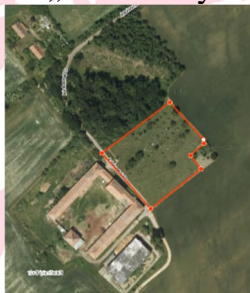
Zone 3 „Kateřinský dvůr“

Connection to electric network available in zones 1-3 but it's limited by network capacity.